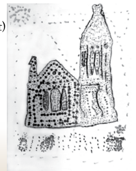
By Benjamin H.