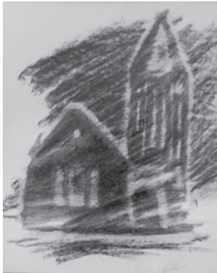
By Robert B.

On Tuesday, May 24 th months of Museum of Early Trades & Crafts visits and artistic efforts culminated in the opening exhibit reception for Amazing! Impressions of the Museum of Early Trades & Crafts . Over 50 visitors gathered at the Museum to meet the artists and see their creations.