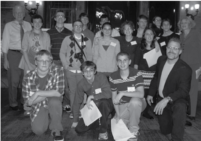
The poets and their advisors

This fall, thirteen sophomores from The Craig School in Lincoln Park were able to visit the Museum of Early Trades & Crafts for a Visiting Poets Program, expanding their classroom experience to learn that intellectual pursuit and inspiration come from everywhere. The Craig School is an independent school that specializes in working with students with learning disabilities.