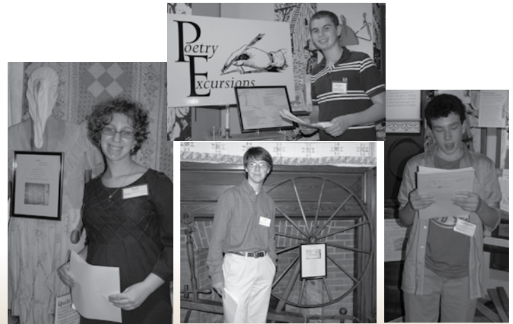
Some of the student poets next to their inspirations

But most of all, thank you to these inspired poets who have looked at the Museum of Early Trades & Crafts in new and different ways and have shared their creativity with us!