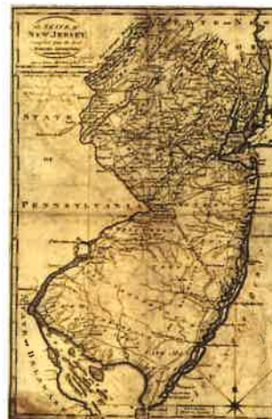
Map of NJ, 1795.

New Jersey’s beautiful and varied landscape offers its residents many reasons to celebrate. From the Great Swamp, to the coastal Jersey Shore, to the mountain ranges, our state’s scenery is diverse and eclectic. But how have people come to learn and understand this land over time? In early 2020, METC will open a new Main Gallery exhibit title Surveying the New Jersey Landscape . The exhibit will feature historic documents, maps, and surveying tools that provide us with a unique lens through which we can better understand, express, and honor our relationship to this precious land.